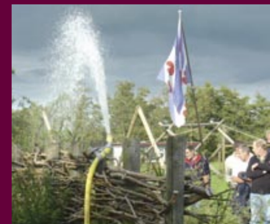
→ Official launch drinking water system Kameleon Island

The plans for the new body of water have already been discussed in a public meeting and the necessary preparations are in progress. The redevelopment plans for the centre are still being drawn up.