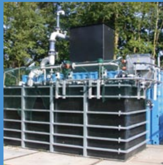
→ A small version of the plant is tested in this container

"The meetings were well-attended with plenty of active participation", says Ted de Jong describing the knowledge exchange meetings held on 19 and 20