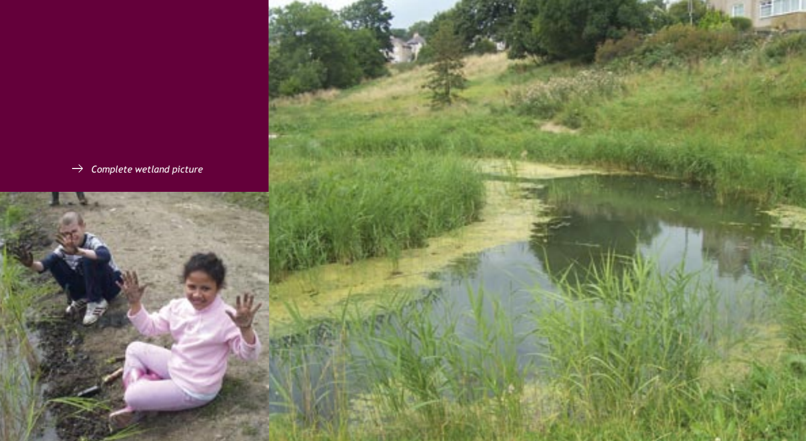
→ Complete wetland picture

GB project Bradford: Visible water in a former English textile city